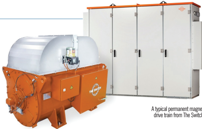
A typical permanent magnet drive train from The Switch

PM propulsion motors and their inverters efficiently turn available energy into thrust. Although standard induction motors can reach high