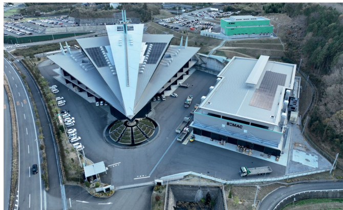
Principal office and factory in Imabari City, Ehime Prefecture