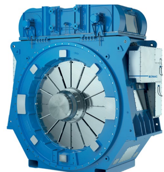
Permanent magnet generator

BEMAC's long-term vision includes becoming the world's largest marine IT company by minimizing greenhouse gas emissions and creating safe, efficient and continuously operating ships. Their MaSSA (Maintenance System for Soundness Sailing Ability) initiative aims to leverage data for optimal ship operations, reducing accidents and enhancing efficiency.